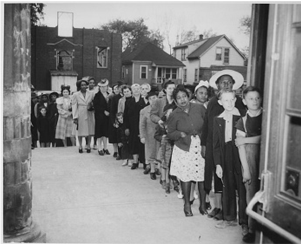
People waiting in ration line